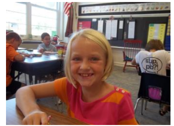
Auction 2013 Photos :